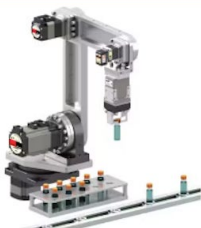
Arm Robot Application