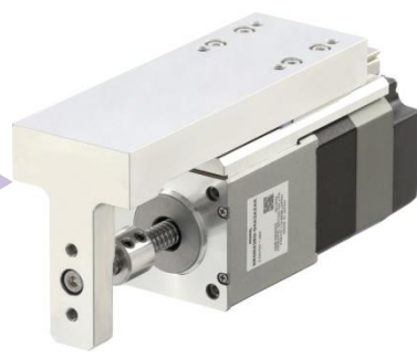
DRS2 Series Compact Linear Actuator

The AZ Series can be paired with our actuators