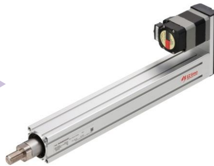
EAC Series Linear Cylinder