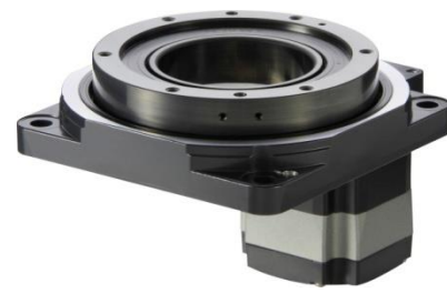
DG2 Series Rotary Actuator